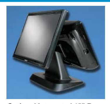
Optional Integrated 15" Rear LCD Customer Display