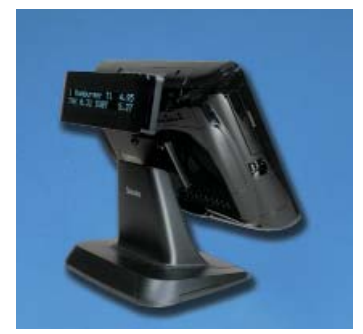
Optional Integrated Rear VFD Customer Display