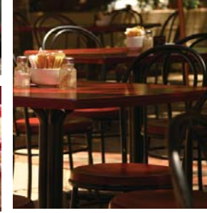
Bars / Ice Cream Parlors / Restaurants