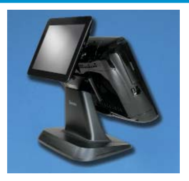
Optional Integrated 9.7" Rear LCD Customer Display